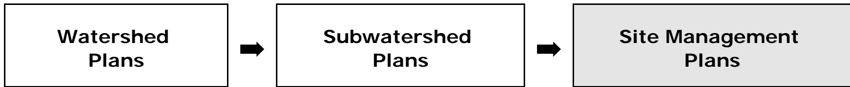
Figure 5: SITE MANAGEMENT PLANS