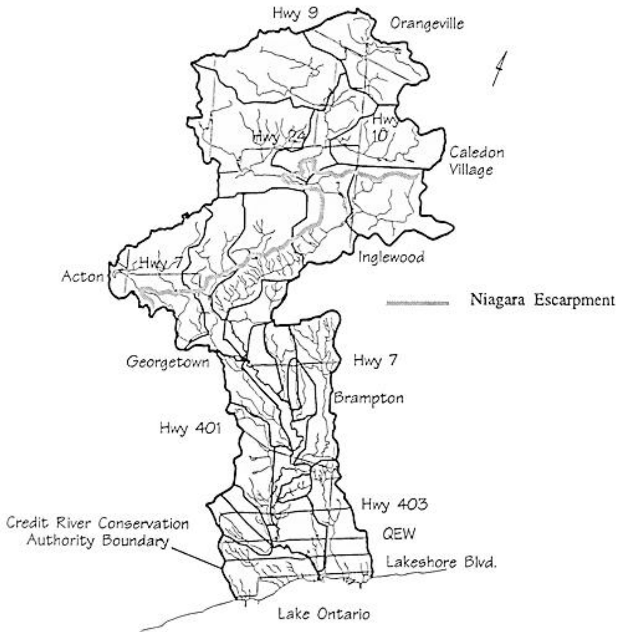
Figure 2: Credit River Subwatersheds