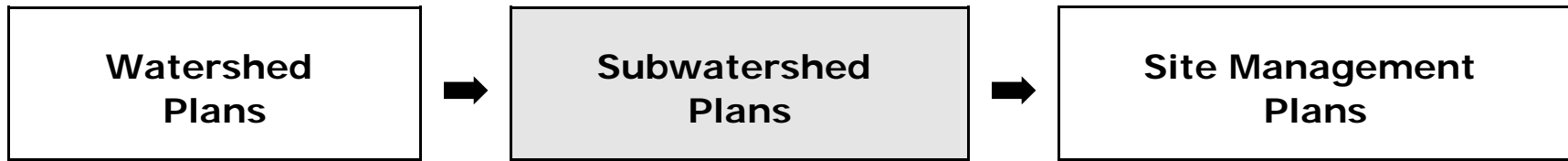
Figure 4: SUBWATERSHED PLANS