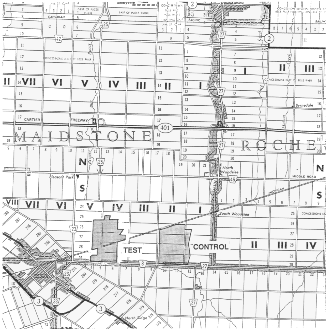
Figure 1: Location of Essex Watershed Study Area.