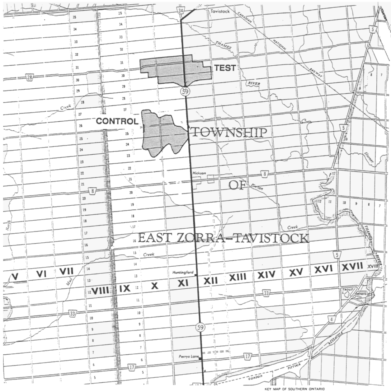
Figure 3: Location of Pittock Watershed Study Area.