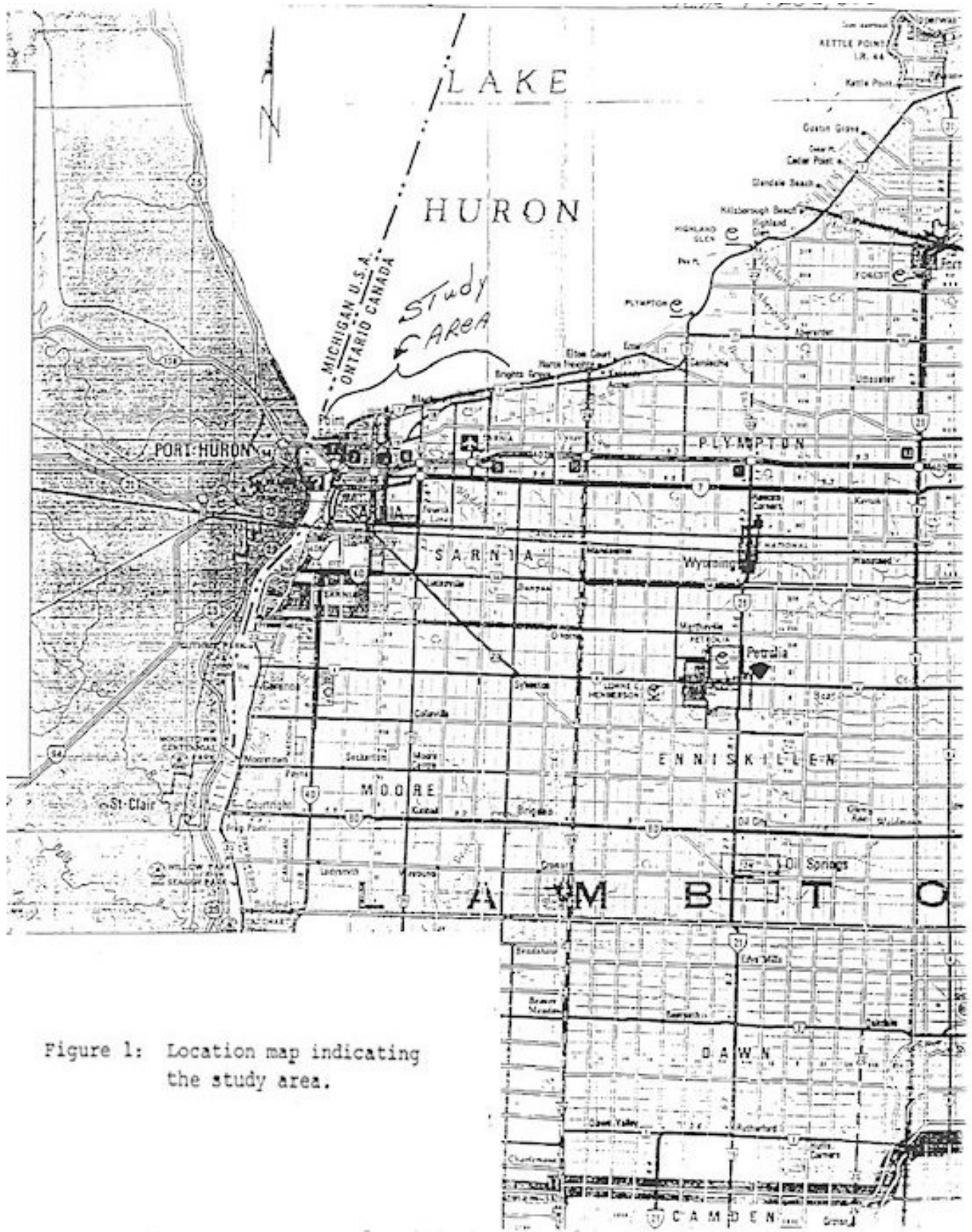
Figure 1: Location map indicating the study area.